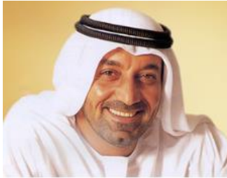
HH Sheikh Ahmed Bin Saeed Al Maktoum President - Dubai Department of Civil Aviation Chairman -Dubai Airports Chairman & CEO -Emirates Chancellor, BUId