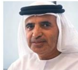
HE Ahmad Butti Al Murhaibi Secretary-General, Dubai Supreme Council of Energy