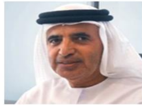
HE Ahmad Butti Al Murhaibi General Dubai Supreme Council of Energy, Secretary