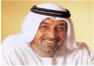
HH Sheikh Ahmed Bin Saeed Al Maktoum President - Dubai Department of Civil Aviation Chairman -Dubai Airports Chairman & CEO -Emirates Chancellor, BUiD